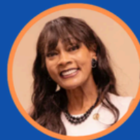
Renee Baskerville Mayor, Montclair